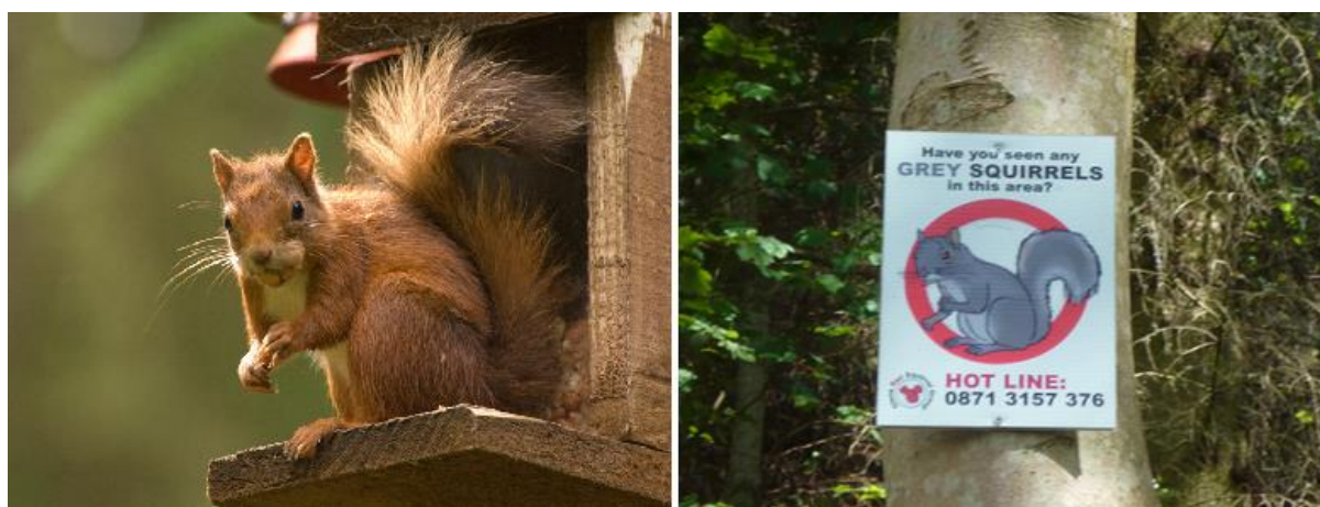
(L) The native red squirrel making use of a manmade feeder (R) A notice about grey squirrels akin to a wanted poster

Some behaviours (such as bark stripping) which are used to vilify grey squirrels have also been reported in red squirrels (Bryce et al, 1997). One volunteer also perceived both red and grey squirrels to negatively impact birdlife. However, negative impacts of the red squirrel were rarely mooted by the volunteers.