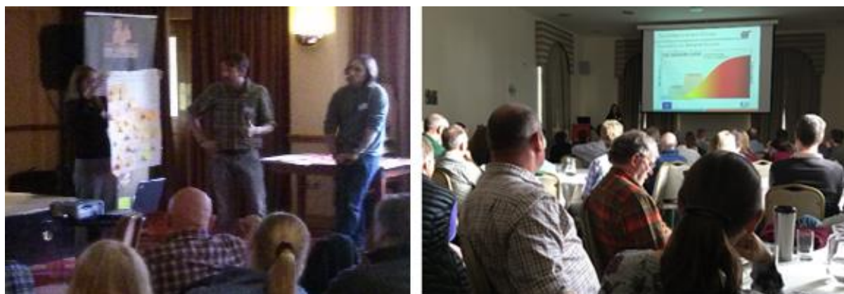
RSU partners presenting feedback to volunteers in Northern England (L) and North Wales (R).