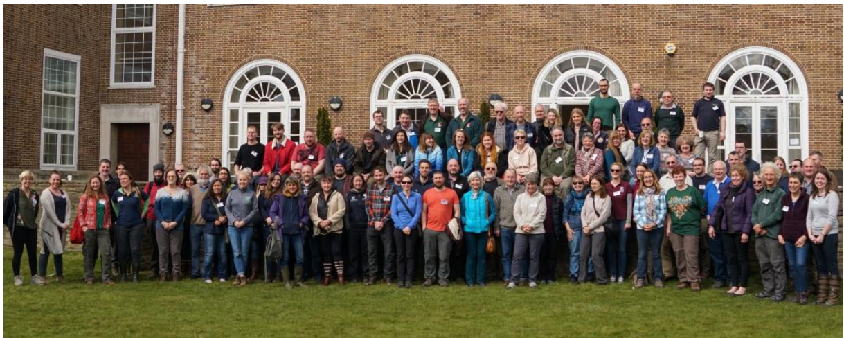
RSU staff, volunteers and supporters at the 2018 knowledge fair in Bangor, Wales