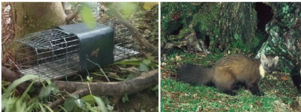
(L) An example of a live capture trap used in an RSU case study area

"Actually, when I was talking to my friends, they would be happier with pine martens doing the control than with humans doing the control. They say that it's more natural, but I don't know how you get pine martens to survive in this area being suburban, there wouldn't be enough other food, so if they start to go for pets, it will be a lot harder to justify having pine martens in Formby if they are getting cats or small dogs" (Volunteer from Merseyside)