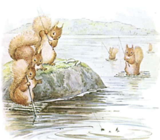
Beatrix Potter's Tale of Squirrel Nutkin

Red squirrels are also iconic for particular localities in Britain, including a number of the RSU case study areas. Like Rotherham & Lambert (2012), volunteers paid tribute to Beatrix Potter and her creation, Squirrel Nutkin, for generating an affinity for the red squirrel.